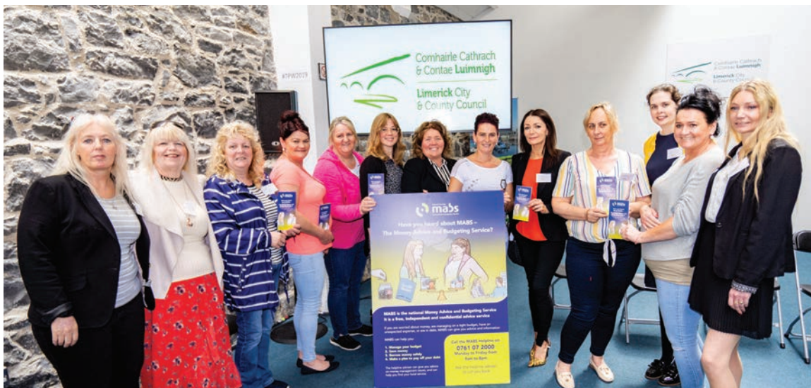
Group picture from the Launch of the leaflet in Limerick during Traveller Pride 2019