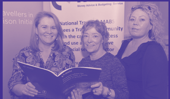
Launch of New guidebook for organisations supporting families of Traveller in Prison