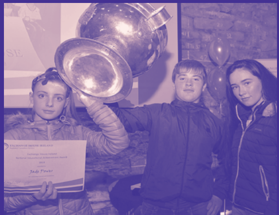
National Education Achievement Awards 2019