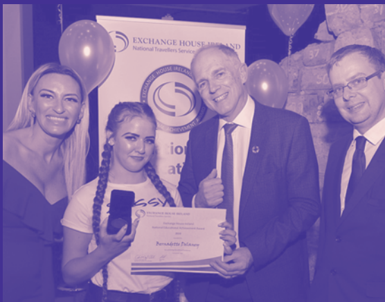
National Education Achievement Awards 2019 with Minister David Stanton